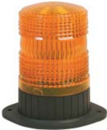
462121 (shown with trim ring)